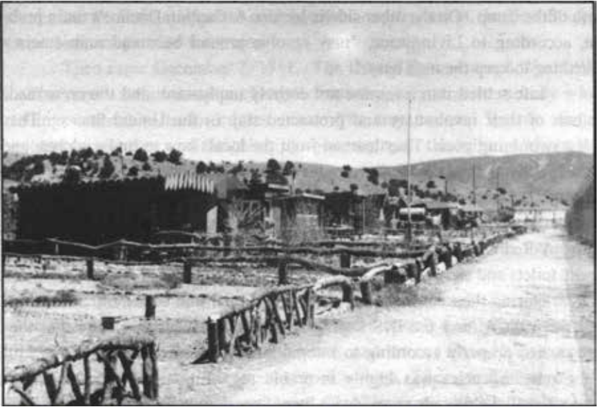
Cottages constructed by German internees at Fort Stanton

limburger cheese and pumpnickel bread from a local bakery. The German government paid for the care of the men and provided each seaman with two dollars a week spending money. One of the most interesting aspects of this influx of German “guests” was the attitude of the people in the neighboring villages of Capitan and Lincoln, who treated the internees with universal friendliness and acceptance and invited them into their homes. In addition, they were on friendly terms with the 500 Merchant Marine patients and staff members at Fort Stanton.