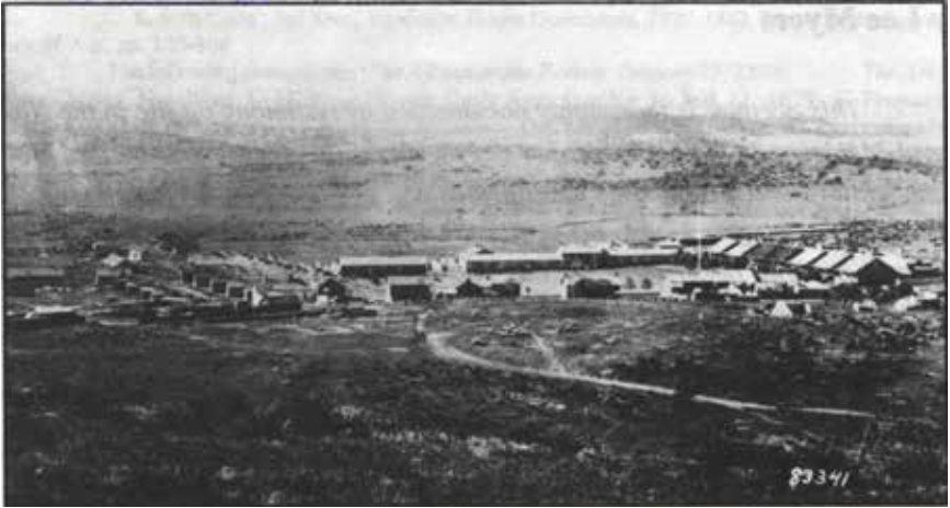
Fort Bayard in the 1870's

In December 1868 the regular garrison at Fort Bayard consisted of Company E, Third U. S. Cavalry (white); and Companies A and D, Thirty-eighth U. S. Infantry (black).