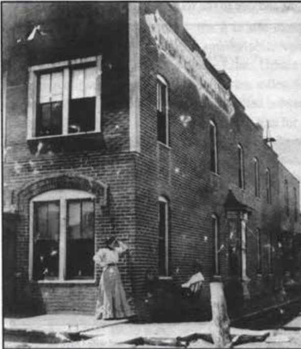
Hotel Ozanne, White Oaks, New Mexico, ca. 1890's.

Both company flyers and local newspapers advertised additional travel connections at Nogal, Ft. Stanton, and Lincoln. 14 Advance arrangements were necessary for a buckboard at Nogal for the mining camps of Bonito and Parson City. Regular buckboards connected at Ft. Stanton for Ruidoso, Weed, and Penasco. The Buck Board Line departed Lincoln for Roswell, Seven Rivers and the Pecos country three times weekly on Monday, Wednesday, and Friday. Whether the Buck Board Line was an Ozanne & Company subsidiary is unknown at this time. Ozanne & Co. not only advertised in the expected flyers and newspapers, but utilized a crude version of the modern billboard. Passengers ascending the canyon to White Oaks proper, were treated to advertisements painted on the flat faces of the rock-lined canyon. “Stop at the Hotel Ozanne” read one of the advertisements. 15 Located on the southeast corner of Carrizo-