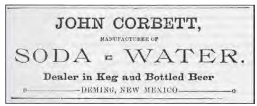
Figure 5 - Corbett Ad (Deming Headlight 9/24/1897)