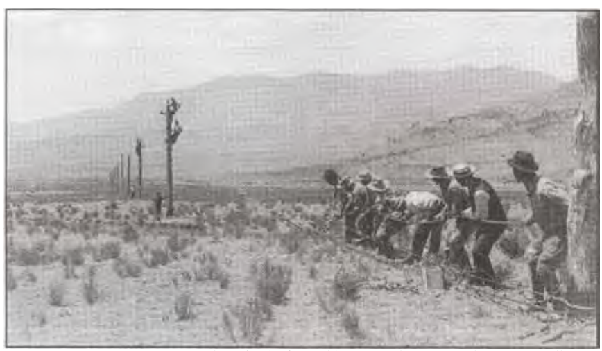
Construction crew stringing power lines for the first public power plant in Lincoln County.

The 250-kVA generator driven by a Corliss valve engine (part of the 750-kVA power plant used to operate the partners' mines and mill) came from the old Vera Cruz mine southeast of White Oaks. The Vera Cruz was no longer operating. To negotiate to buy the Vera Cruz generator and mining equipment, Jack traveled with a $10,000 certified check in hand to Greenville, Michigan. He closed the deal after two weeks of haggling with the major stockholders. The partners disassembled the equipment of the