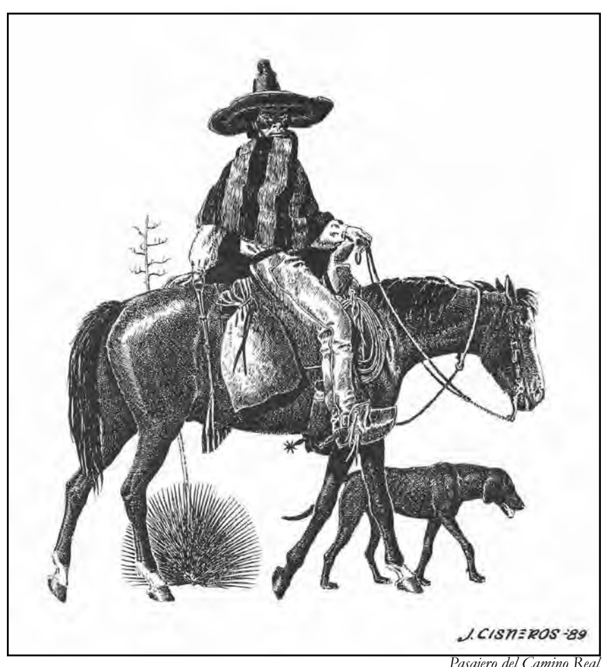
Pasajero del Camino Real

Doña Ana County Historical Society Volume XII Las Cruces, New Mexico January 2005