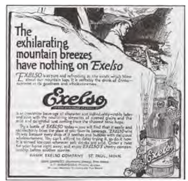
Figure 7 - Corbett Ad for Excelso, a near-beer (undated ad, ca. 1917)

The timing of his near-beer ads was not coincidental. After Pancho Villa's daring raid on Columbus, New Mexico, on 9 March 1916, the Army opened Camp Cody in Deming. Because enlisted