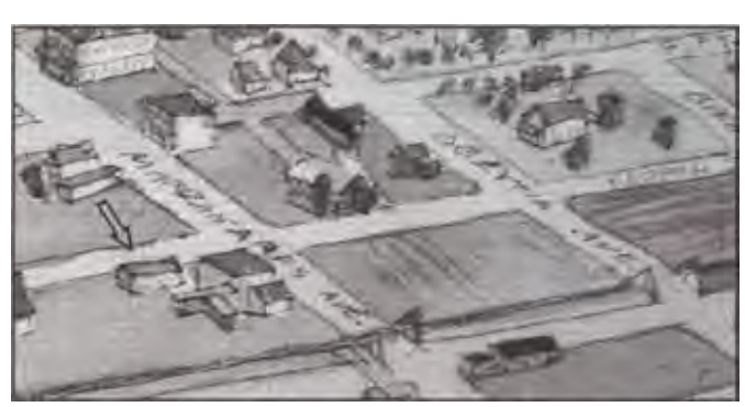
Figure 1 - Johnson & Corbett - 1886 Bird's Eye View Map of Socorro (Socorro County Historical Society)

Coca-Cola Bottling Company, Gardner opened a plant in Deming, and Southwestern spread to four locations in New Mexico and eight in Arizona. El Paso's first soda bottler, Houck and Dieter was itself an outgrowth of A. L. Houck and Company of Santa Fe.<sup>7</sup>