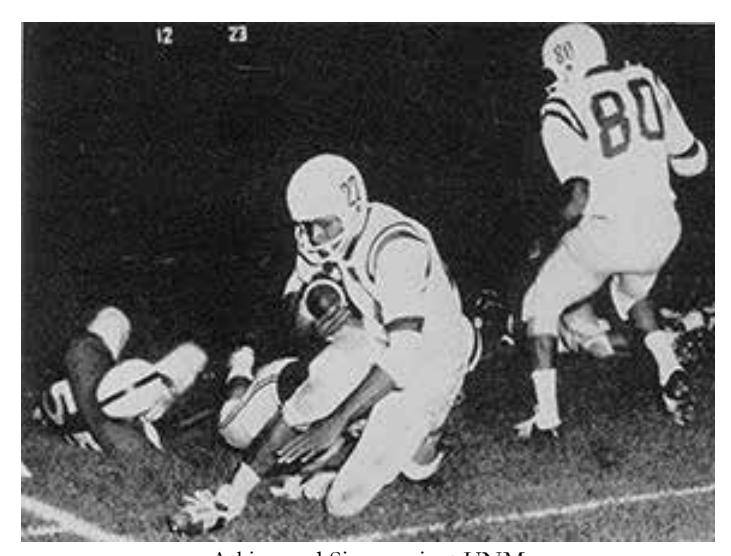
Atkins and Sims against UNM

The Aggies picked up a fourth consecutive win (seventh counting the last three in 1959) with a 34-0 drubbing of I-25 rival New Mexico.