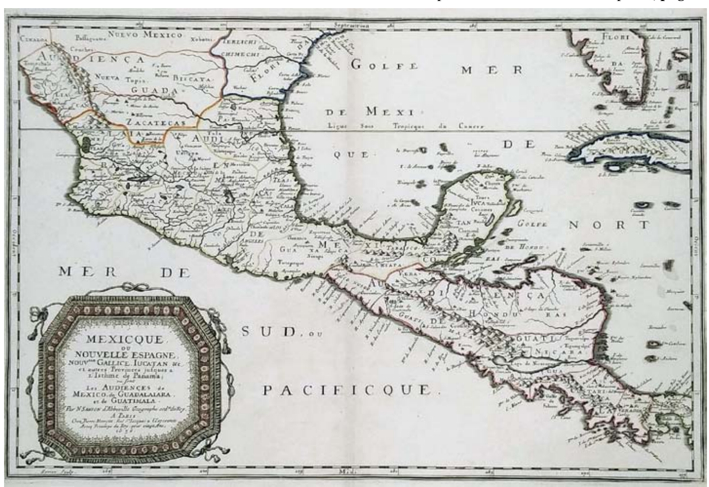
The Nicolas Sanson map from 1656.

See Maps Show Camino Real Campsites, page 3