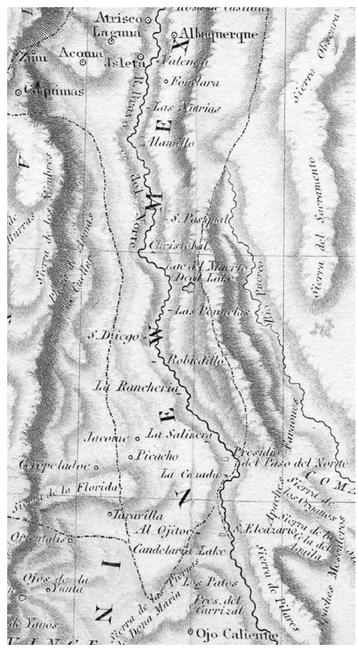
A section of a map called Spanish Dominions of NorthAmerica from 1811.

Many of the maps added to the NMSU collection date from the decade of 1845 to 1855. These maps are significant as they show the changing political boundaries before and after the Mexican-American