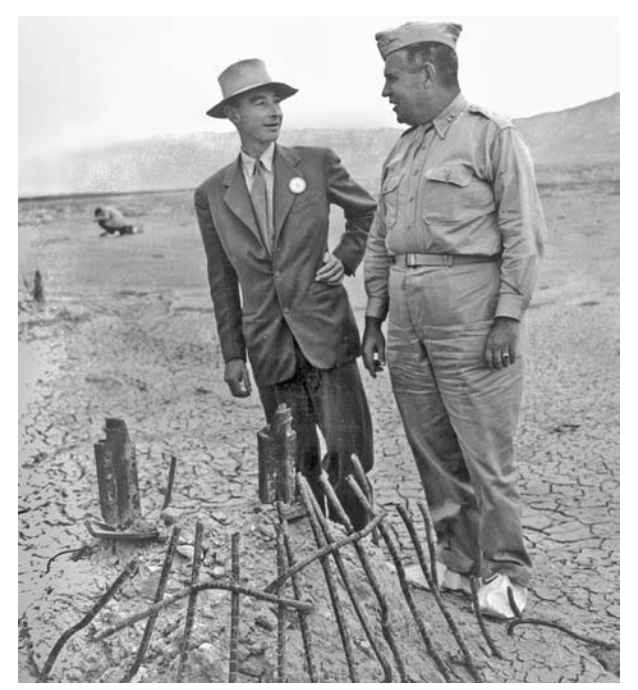
Robert Oppenheimer and Maj. Gen. Leslie Groves at Trinity Site in September 1945 when they took reporters to see Ground Zero. They are standing beside one of the footings to the 100-foot tower on which the bomb was placed for the test. The tower was vaporized by the incredible heat from the explosion leaving four footings exposed. One is still partially visible at the site today.

The presentation will be at our usual time and place....7 p.m. in the Good Samaritan Auditorium at 3011 Buena Vida Circle.