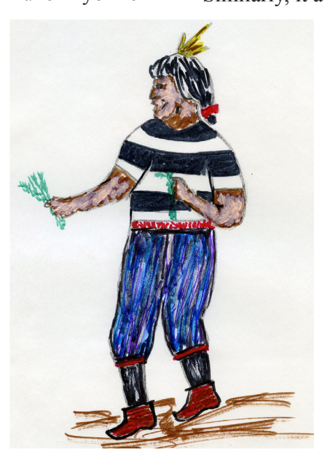
Koshare clown, Santa Ana Pueblo, July 26, 1975.