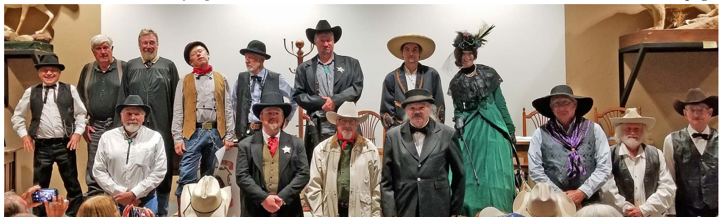
The cast for "The Trial of Billy the Kid."