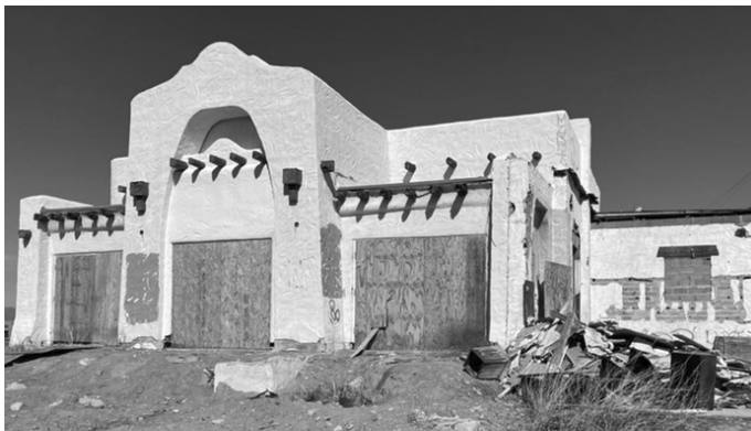
A recent photo of the front of the old club house.

Here's the second pitch — In January we launched a GoFundMe campaign to cover estimated expenses of documenting the Trost Clubhouse. We've been fortunate to have volunteers who jumped in to clear the building of debris and rubble that had been allowed to accumulate over the past decade. This work facilitated completion of 3D LiDAR scans of the building's interior by Carlos Aguilar of Nava Tech. He has also performed computerized 3D imaging of the exterior. Donicio Madrid's firm SnappinHomes has done a series of drone photos of the existing roof.