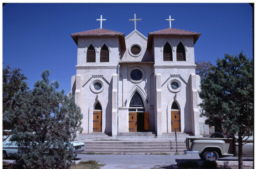
Morris Drexler took this photo of St. Genevieve's church on Main St. in September 1967. He also took pictures in 1966 - all 35mm Kodachrome slides.

you want to fast forward. You can find the link to the YouTube video near the top of the DACHS homepage. Don't want to go there? That link is: https://youtu.be/F2qzw339t0o