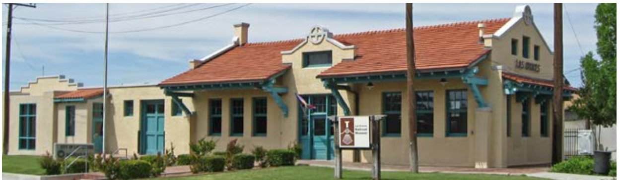
Las Cruces RR Depot/Museum at 351 N. Mesilla St. Walking tour begins at 5:30 pm, May 11

No reservations are required. You might want to bring a bottle of water. Of course there are several watering holes in the area. ☺