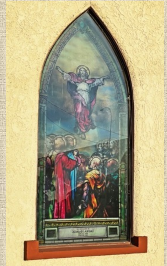
St. James church, now Parish Hall, in 2022