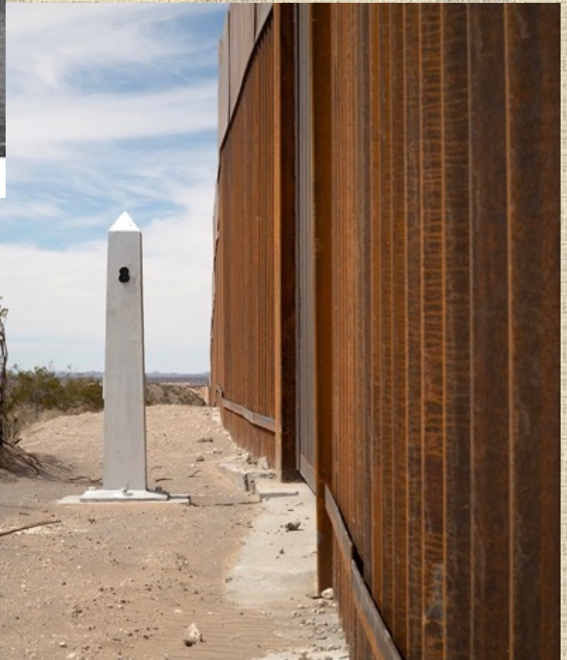
Marker #8 in 2019.