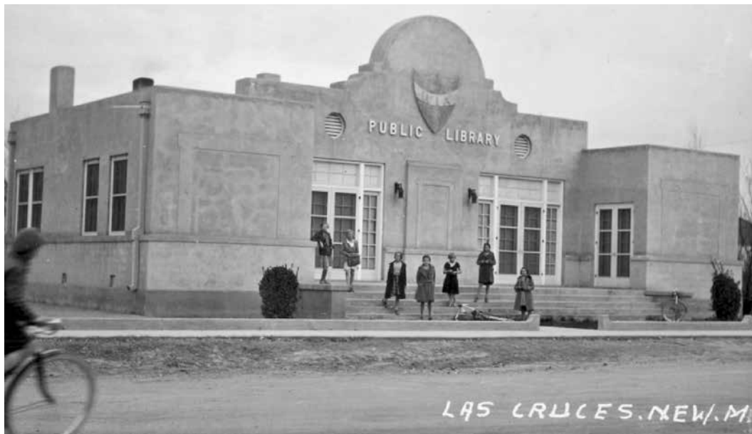
Photo courtesy of the NMSU Archives and Special Collections. Date unknown.

The building currently belongs to the city of Las Cruces.