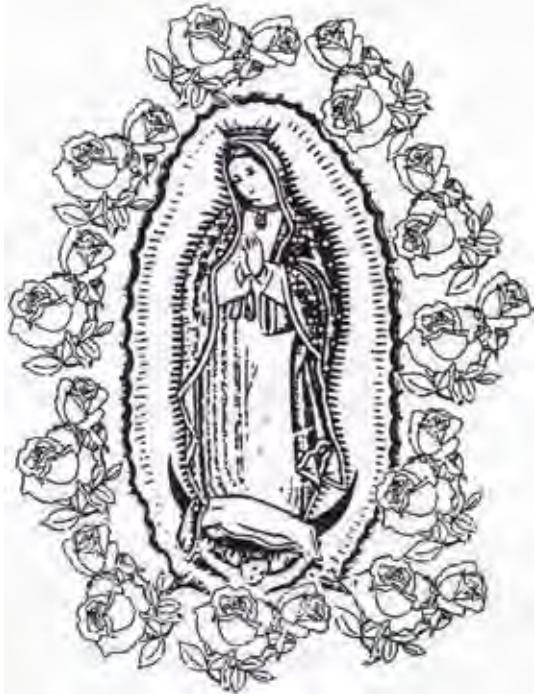
Our Lady of Guadalupe, also called La Guadalupana, is the patroness of Mexico and the most popular religious figure among Catholics of Mexican ancestry.

Specific events are scheduled for each of the three days of the Tortugas Fiesta. The celebration officially begins about 6:30 p.m. on December 10. The members of the Corporation of Los Indigenes de Nuestra Senora de