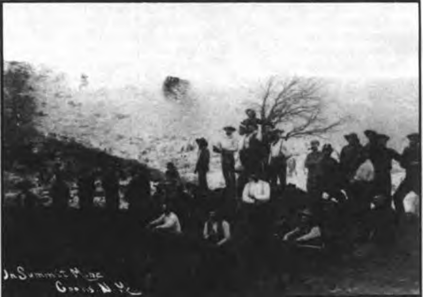
Miners at Summit Mine at Cooks circa 1900