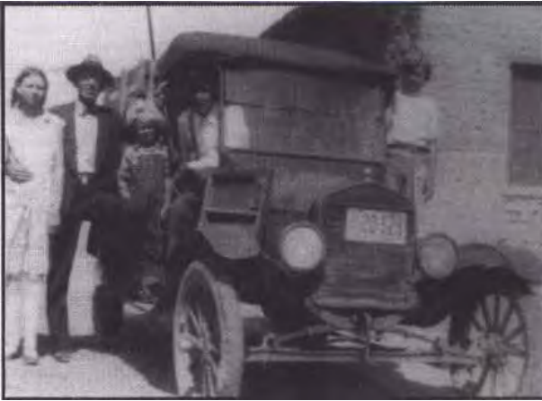
Feeding the “dogie” lambs at Gustafsons’ Engle farm north of Las Cruces In 1928