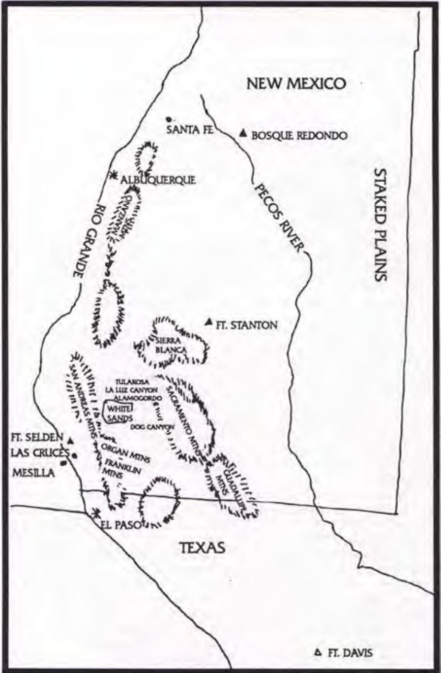
Sites of the wanderings of Cadette and his Mescalero followers in eastern New Mexico and west Texas.