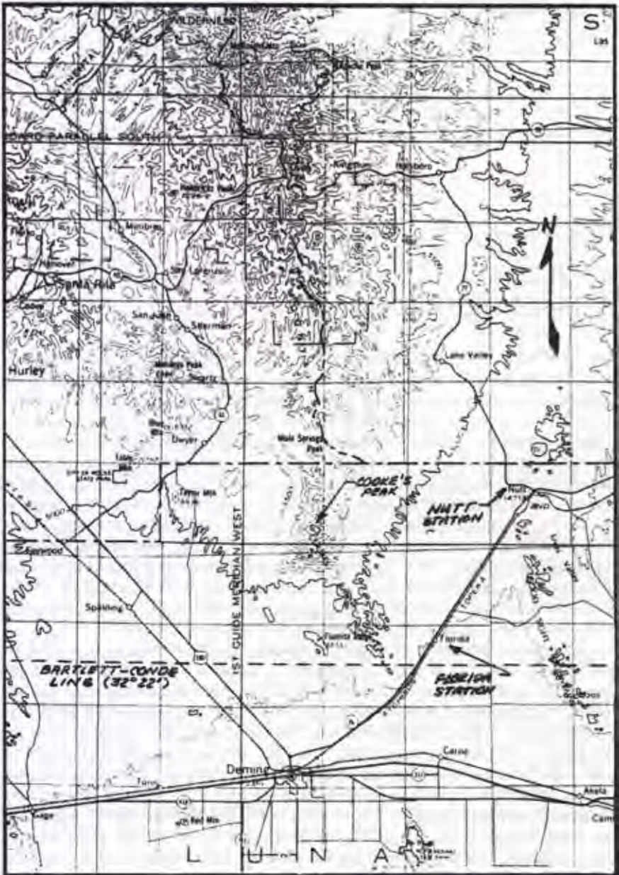
Map showing location of Cooke's Peak north of Deming. (Reduced from USGS Deming East and Deming West topographical maps).