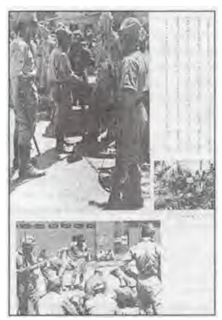
American Defenders of Bataan and Corregidor. History of the Defenders of The Philippines, Guam and Wake Islands Paducah, KY: Turner Publishing Company, 1991, 11.

the importance of hope, which can be rooted in many things: religious beliefs, being part of a close family as a child or adult, feeling a strong sense of group with fellow hostages, deep feelings of patriotism, righteous cause, etc. He asserts that individuals find strength to cope in sources outside of themselves, balancing their own diminished coping skills and eroding self-esteem that they "strive to reduce hopelessness and a diminished sense of self by retaining previous roles while in captivity regardless of modification"49