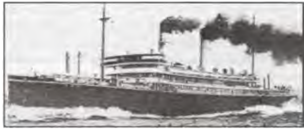
over them cutting Japanese merchant ship, Shinyo Maru. Photo found on Japanese off the air. With no website <a href="http://membernifty.ne.jp/jpnships/meiji02/meiji02_hokubei2.html">http://membernifty.ne.jp/jpnships/meiji02/meiji02_hokubei2.html</a>

out of the hold resulting in the men being covered in their own excrement. With each alert, the hatch covers were closed and tarpaulins thrown over them cutting off the air. With no water or food, men wiped the sweat