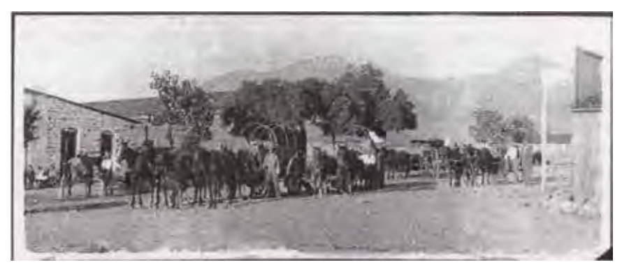
Figure 1, Ore wagons in front of the Bentley Store circa 1905

The role Bentley and his property played within the historical contexts of commerce and transportation was the mystery and ultimately