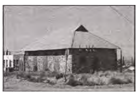
Figure 3, Organ school

The National Register's standards for evaluation include