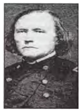
Colonel Christopher "Kit" Carson

found that while eight buildings were usable only one had a decent roof. All the rest, "afforded hardly any shelter at all from the heavy rains that fell during the summer season" or from the earlier winter snows. "Everywhere there were masses of earth and rubbish ... and no attempt had been made to clean it away. "There simply were not enough troops to both repair the fort and to campaign against the Mescaleros. There were some signs of improvement. A "small acequia of clear water, diverted from the Bonita about one mile above the fort, flowed through channels on all four sides of the