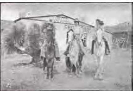
Figure 4, Charles Bentley, on horse, dates this photograph to approximately 1910

The log cabin museum on Main and Lucero in Las Cruces is another example of lost integrity in terms of listing qualifications. Because location and setting embody significance, as well as