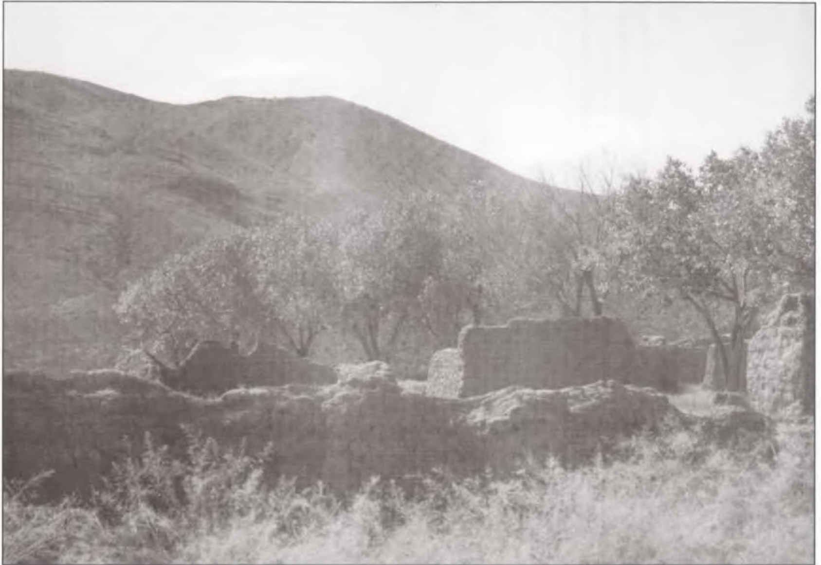
Fort Selden in 1994