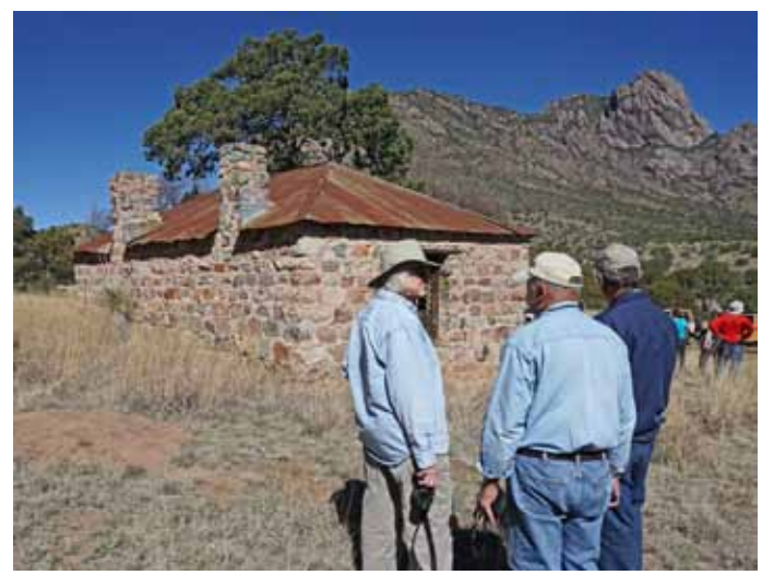
The Issac's stone house.