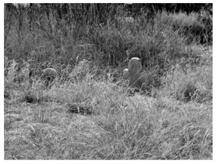
Gerry Veara's photo shows the two remaining grave markers. The little one is in the grass on the left.

In conversations, Karl took time to explain the process. Normally, such a small tract, especially a cemetery that must remain a cemetery, wouldn't be put up for auction but it could be if someone was interested. The cost estimate was about $700 to settle the account.