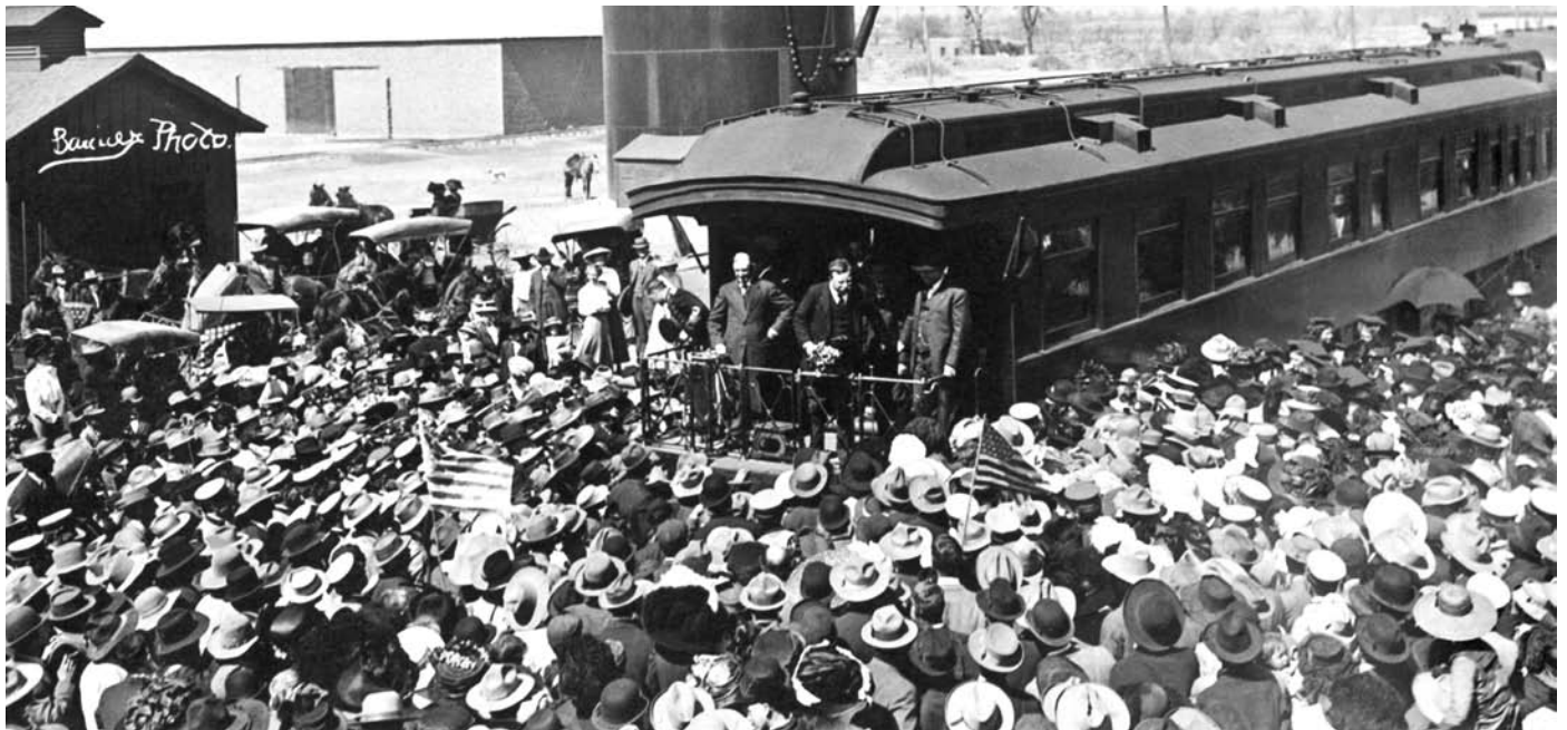
A huge crowd of Las Cruces residents came out to see and hear Roosevelt.