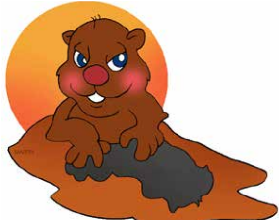
Happy Groundhog Day