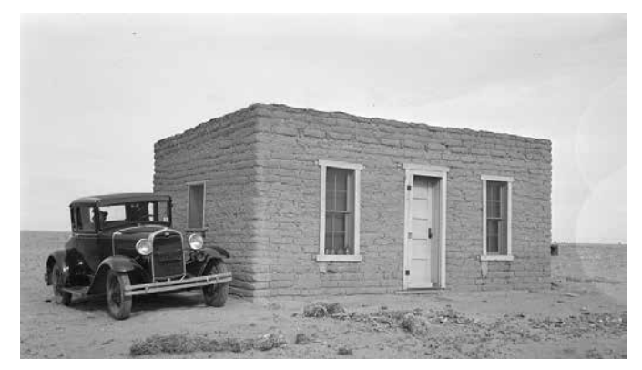
Home in a Land Use program in the little community of Crater, New Mexico, in western Doña County, circa 1936. Doyle Piland's history of Crater will appear in a subsequent Newsletter

AND FINALLY: A prosperous New Year, full of historical achievements, to all. Susan