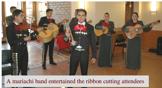
A mariachi band entertained the ribbon cutting attendees