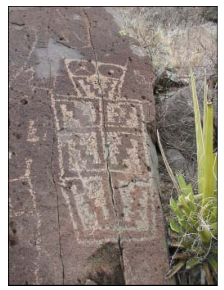
Indian Rock Art photograph from LeRoy Unglaub's extensive collection. On this piece, note the Google Eyes, which are a common feature of much of the Mogollon rock art found around this area.