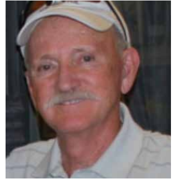
Bob Gamboa Photo Courtesy Cal Traylor

now known as Pioneer Park. They purchased a water wagon to sprinkle the dirt streets, to reduce dust. They built the W.I.A. building still in use, it was the first library. They also had other fund raising events, but the hearse was the most innovative.