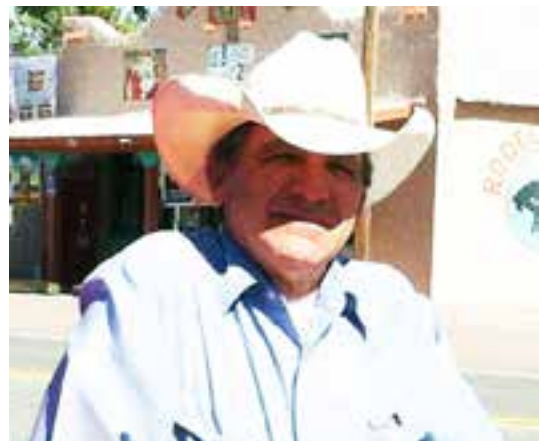
Bill Cavaliere

Our November 21 st meeting will begin at 7:00 PM at the Good Samaritan Auditorium, 3011 Buena Vida Circle. The program will feature a presentation by Bill Cavaliere. Bill, who gave our April program on early border settlers, will return with a talk on the two surrenders of Geronimo .