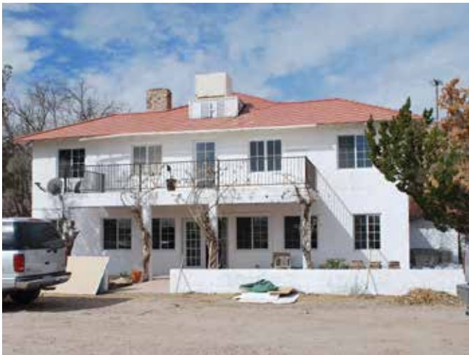
Current facility under renovation

Facilities at Radium Springs date back to the 1880s when it was known as Fort Selden Hot Springs. In 1912, the Fort Selden Hot Springs Resort, National Spa and Improvement Co. was formed to develop the springs. The site had long been a water stop for the railroad which is just a few yards from the inn. Quality lodging for passengers was an important part of the Santa Fe Railway system during the late 19th and early 20th centuries. The inn was built in 1928-31 as a tourist