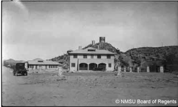
Description: Lodge at Radium Springs Location: Radium Springs, New Mexico

Facilities at Radium Springs date back to the 1880s when it was known as Fort Selden Hot Springs. In 1912, the Fort Selden Hot Springs Resort, National Spa and Improvement Co. was formed to develop the springs. The site had long been a water stop for the railroad which is just a few yards from the inn. Quality lodging for passengers was an important part of the Santa Fe Railway system during the late 19th and early 20th centuries. The inn was built in 1928-31 as a tourist