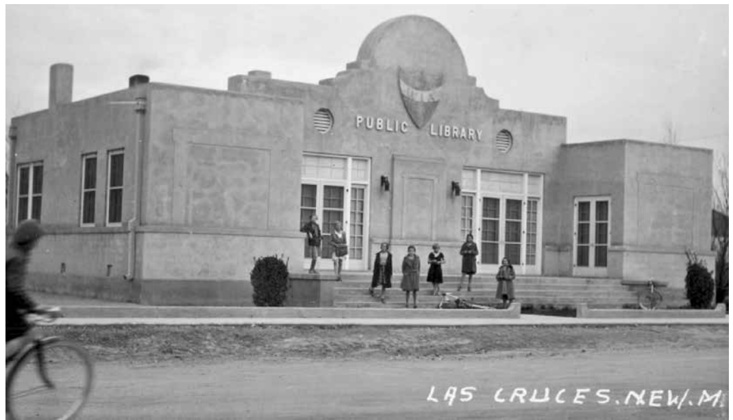
Photo courtesy of the NMSU Archives and Special Collections. Date unknown.

The building currently belongs to the city of Las Cruces.