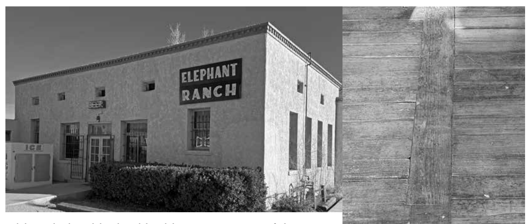
Although the old school building is now part of the Elephant Ranch bar, the exterior retains its appearance from the 1920s. The windows, door and parapet are the same. In fact, looking through the windows, it is quite evident the glass is wavy and old. The flooring inside is also original although the space has been divided up. At right is a strip of patched flooring where a divider or wall once stood near the entrance.

According to Sally Kading, in the 1920's, the main street of Fairacres consisted of a tourist court, two stores, two cafes, three filling stations, the post office and the grade school.