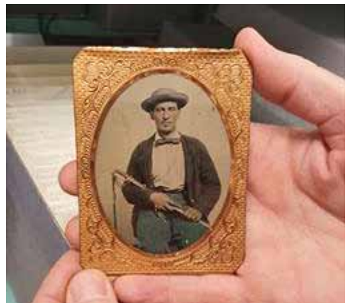
Tintype from the archive's Blazer Papers Collection.

The staff is very friendly and will be glad to help you. You must sign in and provide identification in order to use these items, but you do not need to have a library card. The general hours of the Reading Room are 9:00 a.m. – 4:00 p.m., Monday through Friday, though they vary when classes are not in session.